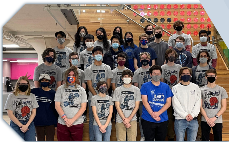
CWRUbotix ROV Team Photo