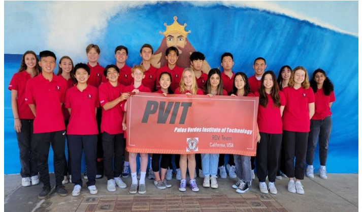
2022 PVIT ROV Company

2021: 4 th Place MATE Worlds Competition, Ranger 2019: 2 nd Place Southern California Fly Off, Ranger 2018: 2 nd Place Southern California Fly Off, Ranger 2017: 5 th Place MATE Worlds Competition, Ranger 2017: 1 st Place Southern California Fly Off, Ranger 2016: 4 th Place MATE Worlds Competition, Ranger 2016: 1 st Place Southern California Fly Off, Ranger 2015: 3 rd Place Worlds MATE Competition; 1 st Place Mission Scores, Ranger 2015: 1 st Place Southern California Fly Off, Ranger 2014: 5 th Place Worlds MATE Competition, Ranger 2014: 1 st Place Southern California Fly Off, Ranger 2013: 2 nd Place Southern California Fly Off, Ranger 2012: 2 nd Place International MATE Comp, Ranger 2012: 1 st Place Southern California Fly Off, Ranger 2011: Harry Bohm and Jill Zande Sharkpedo Award, Ranger 2010: 2 nd Place Southern California Fly Off, Ranger