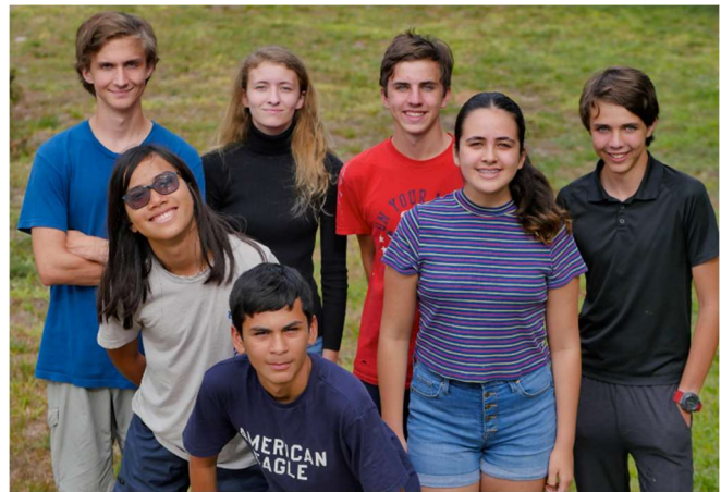
Team Photo