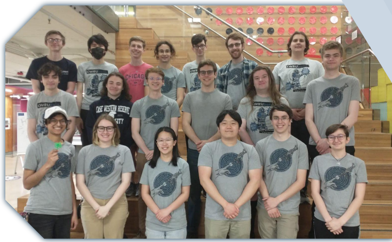
CWRUbotix ROV Team Photo