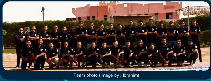
Team photo

A RETURNING COMPANY FOR 10TH YEAR IN THE COMPETITION