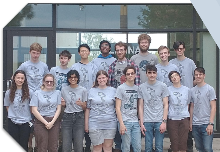
“Scuba Dooba Tuba Electric Beluga”