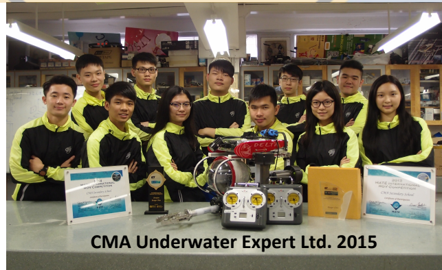
CMA Underwater Expert Ltd. 2015