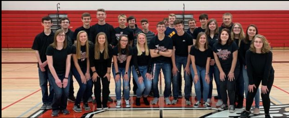
Oostburg ROV Company- member information below.

Distance to International Competition: 1,159 km Returning Team: 3rd year as a Ranger Team ROV Name: Otis-Rupert Total Cost: $2,345 Size and Weight: 43.2cm x 38.1cm x 29.2cm, 3.55 kg Total Build Hours for ROV: 380 hours Safety Features: Custom Engineer Motor Shrouds Special Features: Task Specific Tooling