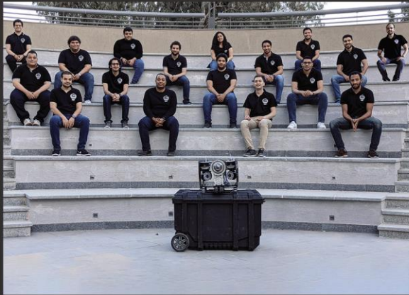
Invictus company members with Brotta II