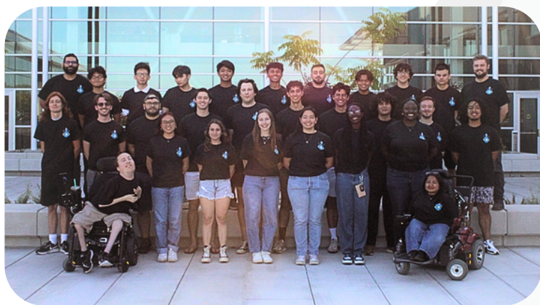
Figure 1. Team Picture by Alec Hayashi