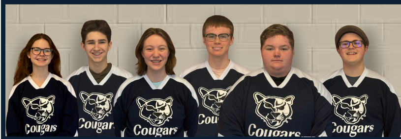
Team - Cougar Robotics (Somers, 2025)