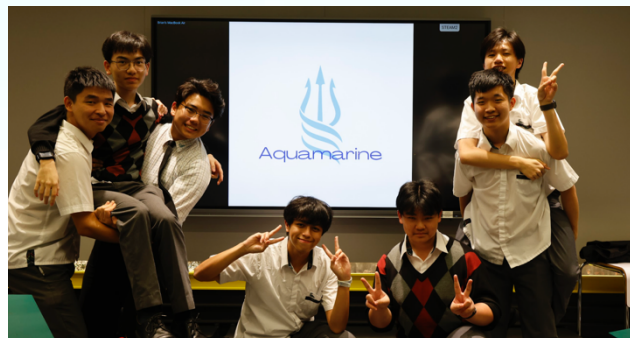
Figure 1: Group Photo

This year, Aquamarine travelled 12304 km to Alpena, Michigan for the competition.