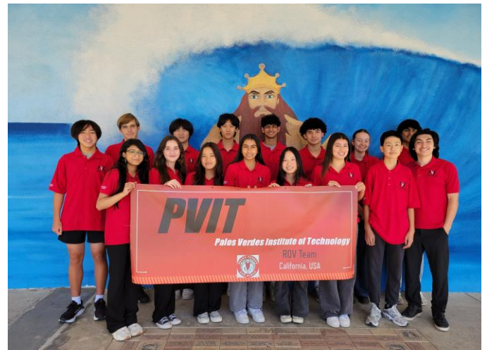
2025 PVIT Fitzgerald Team Photo By: Julie Smalling

Special Features: Arduino and Raspberry Pi Microprocessor, Blue Robotics T200 Thrusters, High-definition video from 3 cameras, dual-positioned manipulator, fast propulsion, independent profiling float